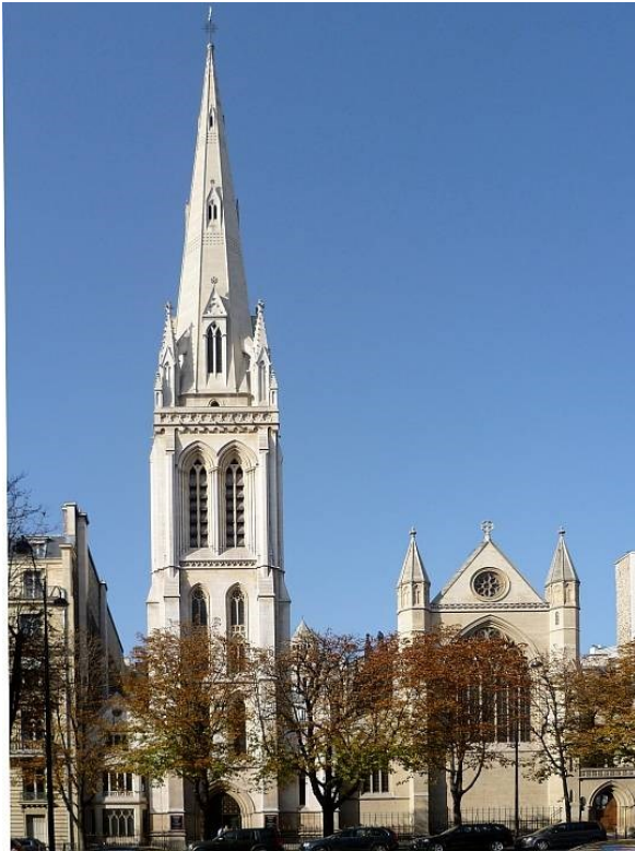
The 278-foot-tall spire, which peaks above the roofs of the Right Bank, is one of the tallest in Paris.

This Episcopal cathedral is the gathering church for the Convocation of Episcopal Churches in Europe, which consists of nine parishes and seven missions in five European countries. The church, which became a cathedral in 1922, is also the seat of the bishop in charge of Episcopal churches in Europe. The church is situated beside the River Seine in central Paris.