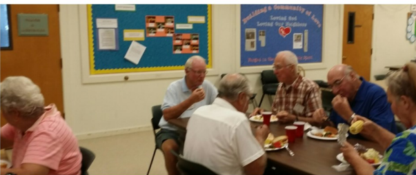
Picnic in the Church August 10, 2014