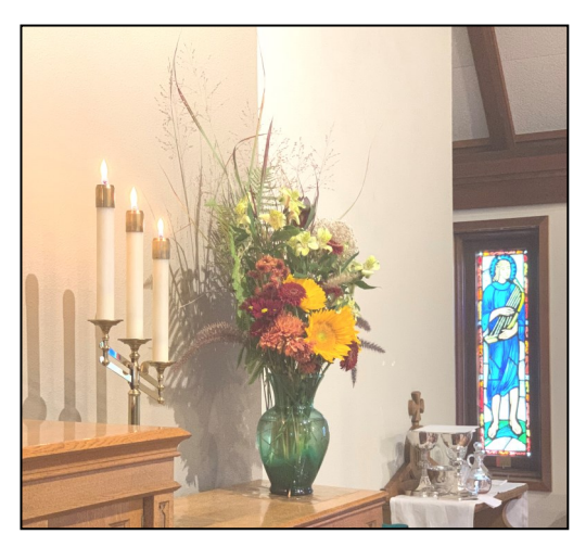
Sign up in the Office to provide flowers for the altar!

stgeorge@stgeorgeepiscopal.com www.saintgeorgesepiscopal.com www.facebook.com/episcopalroseburg