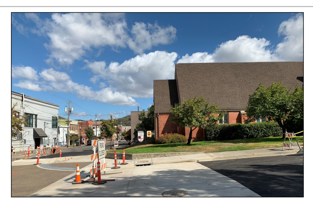
The City of Roseburg's street repair project is nearing completion around St. George's.