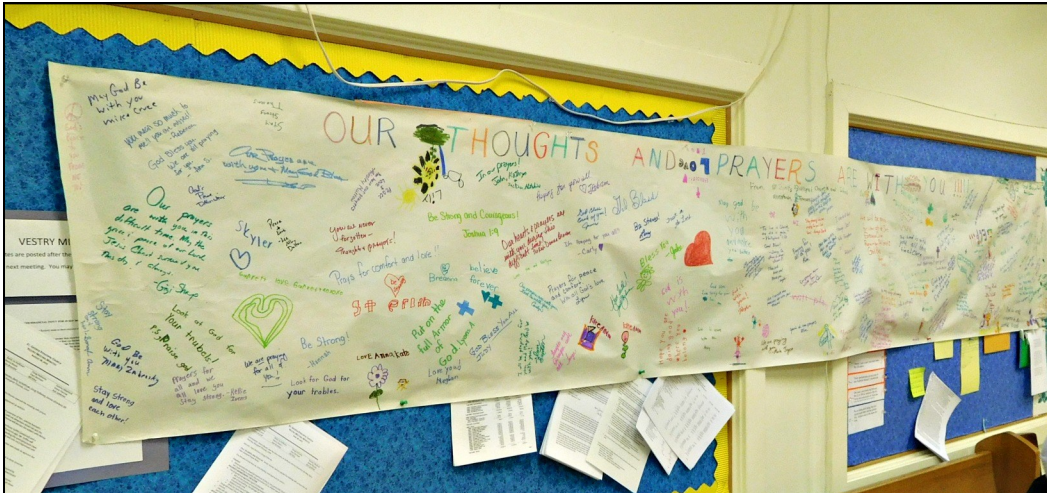
All Saints' Episcopal Church in Morristown, TN sent us this splendid banner signed by their parishioners. It stretched across two of our bulletin boards. Below you can see a close-up of some of the messages.