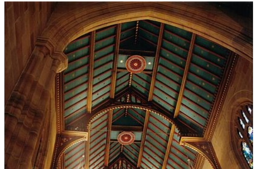
A hammerbeam roof is a decorative, open timber roof truss typical of English Gothic architecture.

The interior has a sense of grandeur, in part due to the lofty hammerbeam roof.