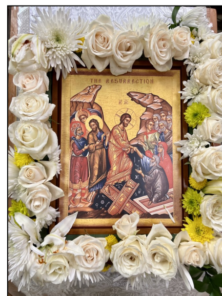
Above: Icon of the Resurrection