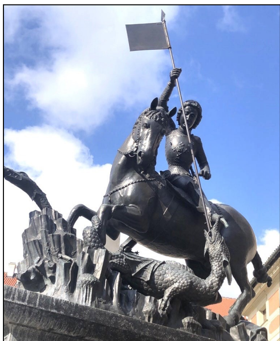
Prague in the Czech Republic. Here is St. George and the Dragon at the Prague Castle.