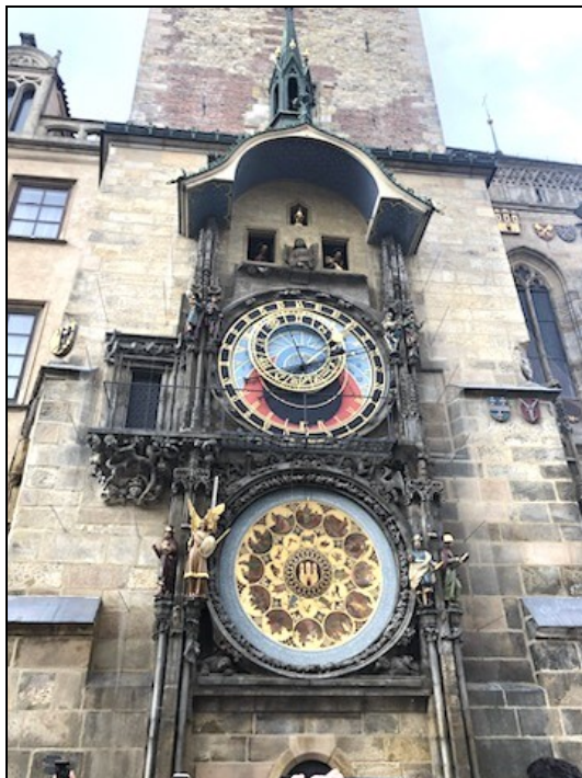
The Prague Astronomical Clock, first installed in 1410 and the oldest clock still in operation.