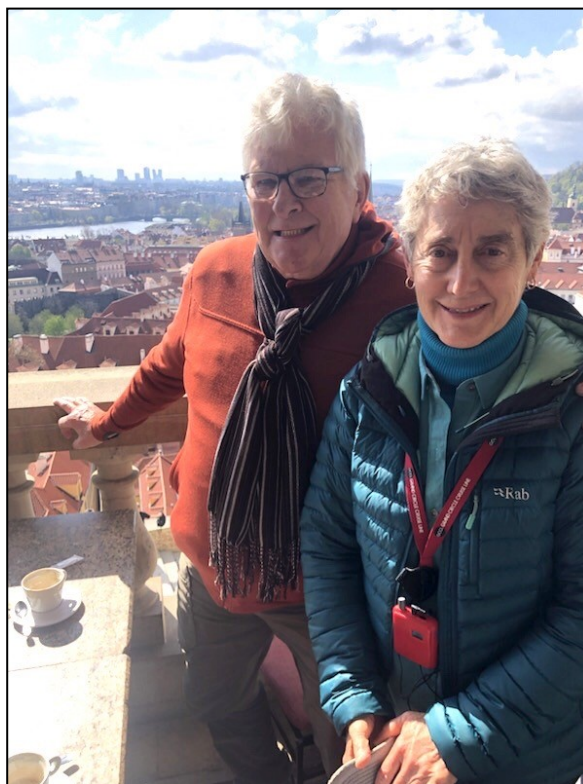
At a coffee shop overlooking Prague.