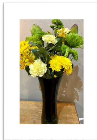
BJ brought altar flowers from her garden to celebrate the Hoffman Anniversary