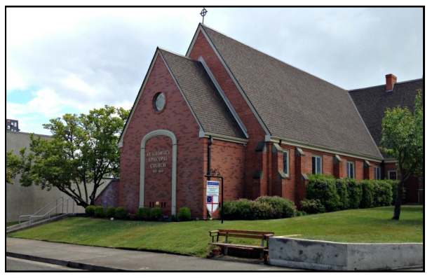
Mission Statement: "Loving God, Loving Our Neighbors"