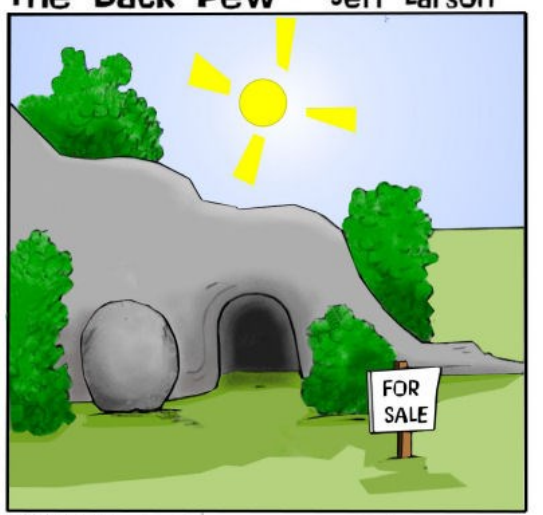
FOR SALE - Single owner tomb. Only used three days, and still has that new tomb smell. Reason for sale.. resident was resurrected.