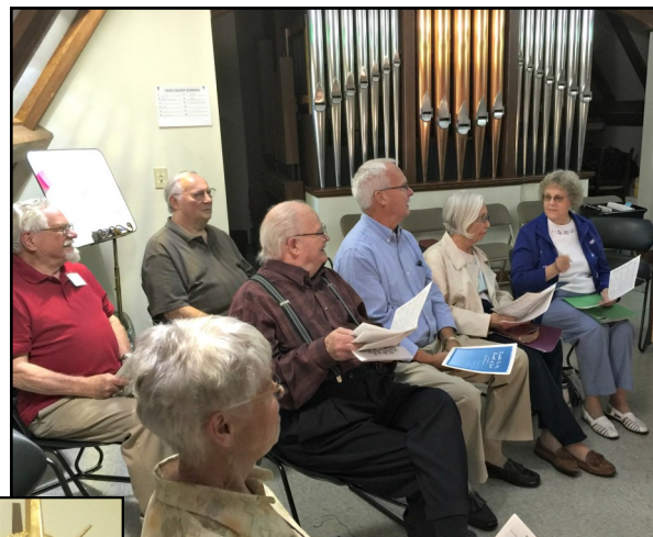
Above: Choir rehearsal for Pentecost. See how much the choir members enjoy singing together? You are invited to sing with the choir too!