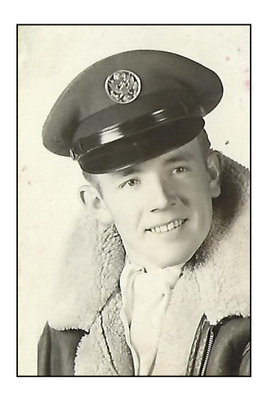
Wally served in the U.S. Air Force as a B-29 Central Fire Control Gunner.

He flew 25 combat missions during the Korean Conflict and was awarded the Air Medal for his part in the raids that resulted in heavy damage to Communist installations and equipment.