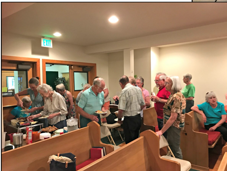
June 24 meeting (left). There were so many people attending that we moved from the library into the church.