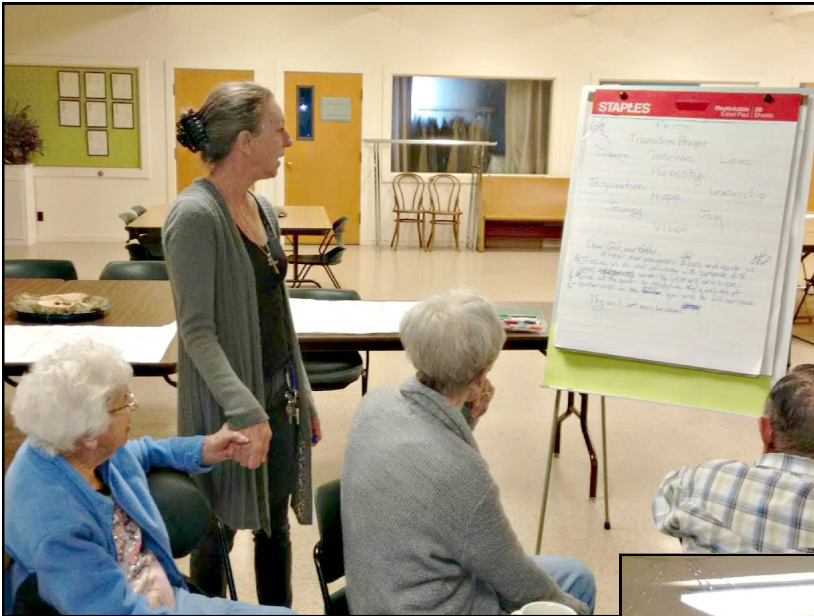
June 3 meeting—photos left and center by Pete Benham