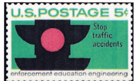
Scott catalog #1275 was issued on September, 3, 1965

Traffic deaths in 2019 totaled 36,120 at a cost of $242 billion. Fatalities in 1965 totaled 47,089.