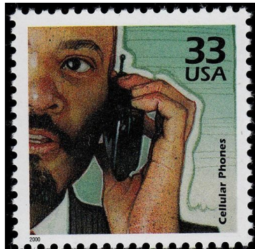
Scott catalog #3991o

This stamp is one of 15 stamps on the Celebrate the 90's sheet Issued in 2000 as part of the Celebrate the Millennium series.