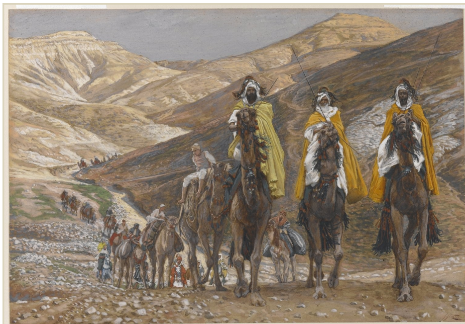
James Tissot, The Magi Journeying (1886-1894)