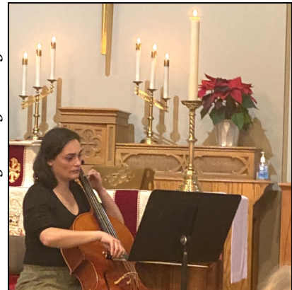
Christmas Eve Concert