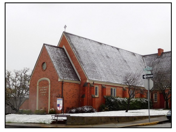
Mission Statement: "Loving God, Loving Our Neighbors"