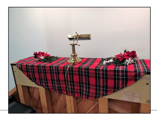
Special thanks to our splendid Altar Guild. Their loving attention to decorating the nave for Christmas was apparent in every little detail as seen in these piano adornments (left).