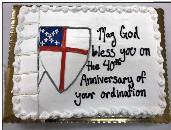
Cake and fellowship after the service