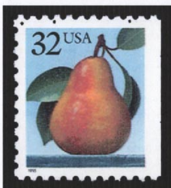
Scott #3302, Issued July 8, 1995, in Reno NV

The U.S. Department of Agriculture made it official in 2004. USA Pears states that 84% of shoppers cannot tell when a pear is ripe because not all pears turn yellow and ripen from the inside out. Gently press near the stem with your thumb. When it gives to gentle pressure it's ripe.