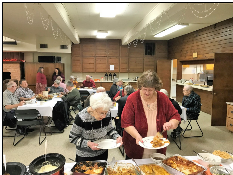
Stewardship Ingathering Potluck, November 26, 2017

stgeorge@stgeorgeepiscopal.com www.saintgeorgesepiscopal.com