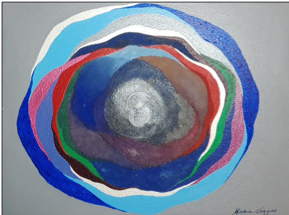
"Emanating from the Source" by Hellene Higgins Chapman acrylic paint, 12" x 16"

(Editor's note—this online tour is amazing!)