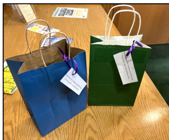
Bags with worksheets and coloring pages for our new young parishioners.