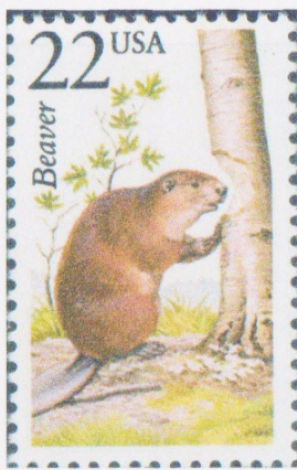
Scott catalog #2316 issued June 13, 1987